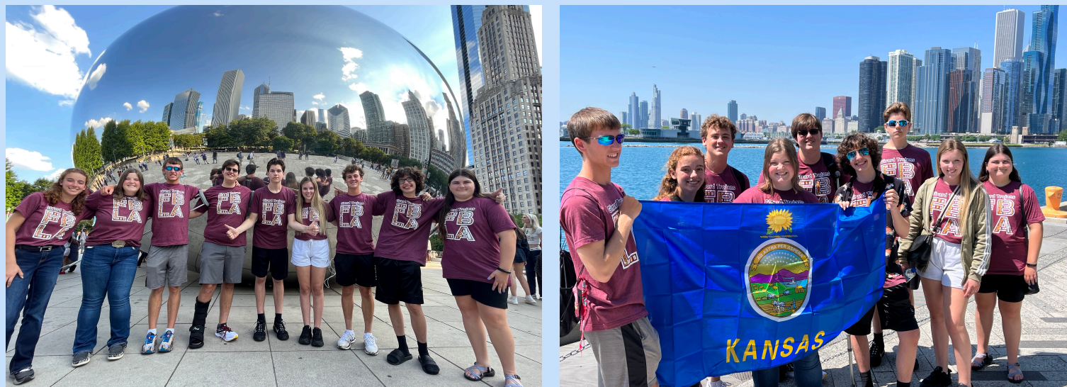
Representing the state of Kansas, Girard High School FBLA members attended a National Competition in Chicago.