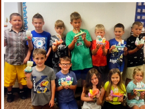
Students show off creations they made during RVH Summer School

Each summer, RVH offers additional learning opportunities for students in Kindergarten through 5 th grade. The program was held Monday through Thursday from 8:00-11:00 throughout the month of June. Academic time was offered, along with a snack and enrichment opportunities. Sixty-eight students were enrolled in the program this summer. The Girard Public Library partnered with RVH and invited students to visit each week. Our local K-State Extension Office also offered learning opportunities for 1 st through 5 th grade students during the summer program. On June 13 th , The Community Health Center of SEK provided an opportunity for families to visit their health van at RVH. Along with activities on campus, students also had the opportunity to participate in a field trip with their class. Students in Kindergarten, 1 st , and 2 nd grades visited Deanna Rose Farm in Overland Park. Our 3 rd , 4 th , and 5 th grade students enjoyed cheering on our Kansas City Royals at Kauffman Stadium on June 29 th . This program, funded through the 21 st Century grant, offers great opportunities for students to continue learning beyond the school year, spend additional time with their peers, and enjoy a variety of activities to continue building academic and social skills. We appreciate the support of our community partners and our families as we work together to ensure the program is successful.